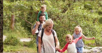
COMMUNITY MASTER PLAN (ACRES)